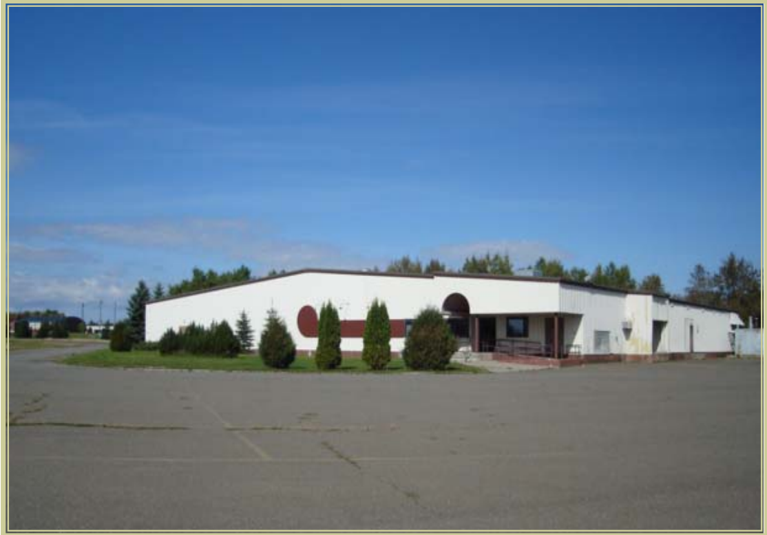
11 Iowa Place

20,000 sq. ft. steel frame, commercial building, pitched roof, loading dock, ample parking/expansion space